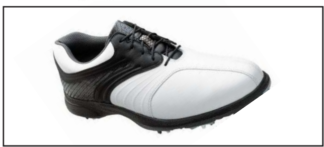
2012 gift for tournament participants: Footjoy Superlite